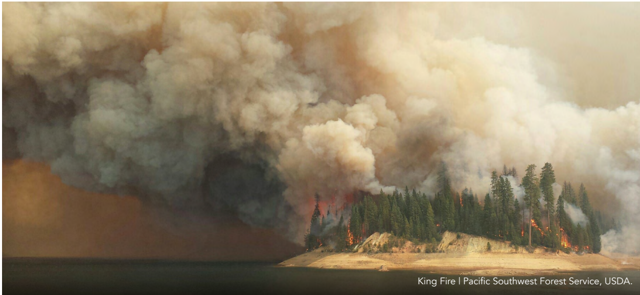
King Fire | Pacific Southwest Forest Service, USDA.

Expert Briefing | Peer-Reviewed Report | Released: Sept. 2023 | CCST & Blue Forest