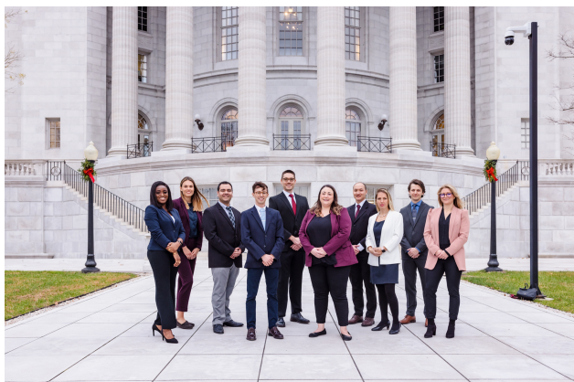
2021-2022 Cohort of Missouri Science and Technology (MOST) Policy Fellows

These models should morph and expand over time, as demonstrated by several states with established programs (Table 1). For instance, after placing legislative fellows for a number of years, CCST (the state of California's STPF host) recently expanded their program to place fellows in the state executive branch. In Missouri, the Missouri Science and Technology (MOST) Policy Fellows program began by placing full-time, post-degree fellows and will expand to placing part-time, pre-degree fellows in 2022. New Jersey has increased the number of post-degree fellows placed through their program as resources have allowed in the past few years.