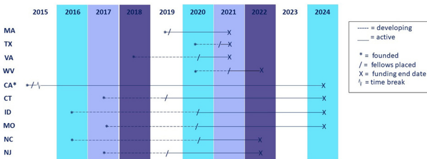
Figure 2. Timelines indicating when each of the currently active programs was founded, when fellows were placed, and the estimated date when funding will expire for the programs (based on survey data collected in summer 2021). *California's development phase began in 2007 and the program first placed fellows in 2009.

As of February 2022, there are ten active state-level STPF programs. Four are part-time fellowships, either working full-time or part-time over 3 to 6 months, and six are full-time, working full-time for 12 or 24 months. Generally, full-time programs tend to take a longer time from founding to placing fellows, whereas part-time programs have been developed over a shorter timeline (Figure 2). This difference may be due to the fundraising limitations or to prioritization of program rollout for proof-of-concept reasons. Among active programs, those with full-time fellowship structures support post-degree fellows, whereas programs with part-time fellowship structures predominantly support fellows who are simultaneously enrolled in graduate school.