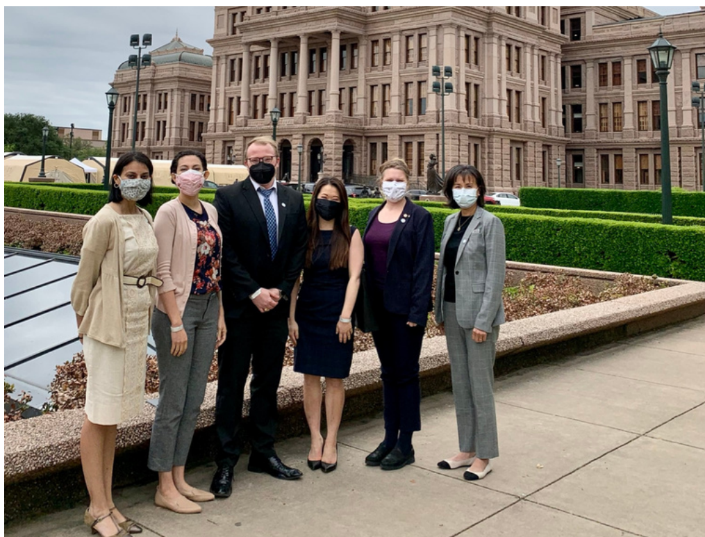
Two Texas Science Policy Fellows with vaccine policy partners in front of the Texas Capitol

Human resources departments may have requirements, guidelines, or best practices to follow during the recruitment and selection process. Host organizations may also have resources related to DEI that can be used for the fellowship program. There may also be additional or supplemental funding opportunities to support DEI efforts or to support historically minoritized individuals.